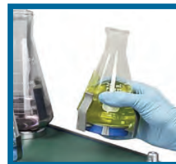
MAGic Clamp Platform H1010-MR with Adjustable MAGic Clamp (H1000-MR-CMB)